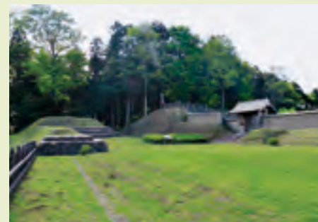
● Hachigatajyo Ruins

Hachigatajyo is a medieval castle built on the top of a sheer cliff overlooking the beautiful landscape of the Arakawa River. It had been called a great castle, but it turned into a site of tragedy when the castle was surrendered after being attacked by large armies in 1590. It is a symbol of Yorii Town and became the first officially-designated historical site in Yorii due to its high academic value. It was opened as a historic park following reconstruction of the moat, earthwork gate and others.