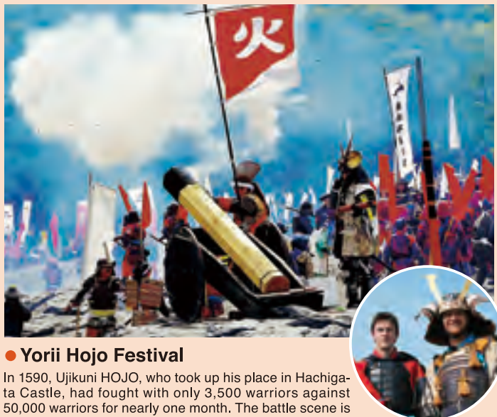
● Yorii Hojo Festival

In 1590, Ujikuni HOJO, who took up his place in Hachigata Castle, had fought with only 3,500 warriors against 50,000 warriors for nearly one month. The battle scene is recreated in the “Yorii Hojo Festival.” On the day of the festival, around 500 people in samurai outfits of that time divide into two armies and battle each other at Tamayodo-gawara after parading in the downtown area. The scene is powerful just like a real medieval battle in Japan.