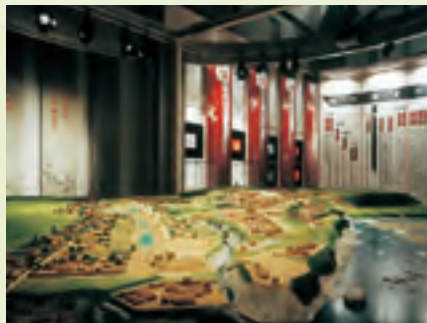
● Hachigatajyo Museum

The symbol tree of Hachigatajyo. Flowers are fully in bloom on its umbrella-shaped branches at the end of March, and the contrast of pink flowers against the blue sky when looking up from the ground is stunning. The 18-meter tree has branches spreading 23.5 m east to west and 21.8 m north and south, and a root circumference of 6.5 m. The tree is illuminated during the time of full bloom.