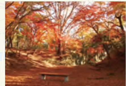
Suzumenomiya Park It is the former site of a villa of Kabuki actor, the seventh Koshiro MATSUMOTO. In an area of more than 10,000 m2, you can enjoy flowers of Japanese dogtooth violet in spring, and autumn leaves in fall. Various trees and flowers grow naturally.