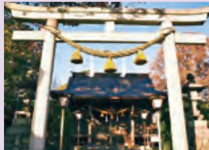
● Munakata Shrine