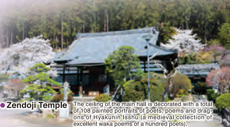
● Zendoji Temple

The ceiling of the main hall is decorated with a total of 108 painted portraits of poets, poems and dragons of Hyakunin Isshu (a medieval collection of excellent waka poems of a hundred poets).