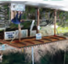
● Water-make Spot

● Yamatomizu The place is very popular with people in search of excellent natural water that is believed to offer blessings for marriage, safe childbirth, perpetual youth and longevity. Yamatomizu is fresh water, so please boil before using it.