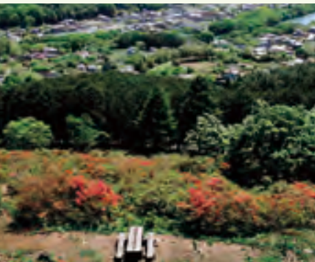
Azalea in Mt. Kanao