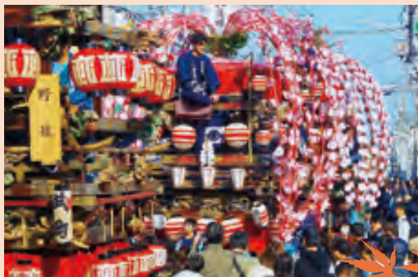
● Yorii Fall Festival

In 1590, Ujikuni HOJO, who took up his place in Hachigata Castle, had fought with only 3,500 warriors against 50,000 warriors for nearly one month. The battle scene is recreated in the “Yorii Hojo Festival.” On the day of the festival, around 500 people in samurai outfits of that time divide into two armies and battle each other at Tamayodo-gawara after parading in the downtown area. The scene is powerful just like a real medieval battle in Japan.