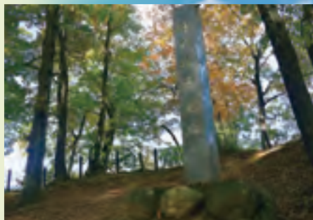
● Monument of the ruins of the Hachigatajyo keep