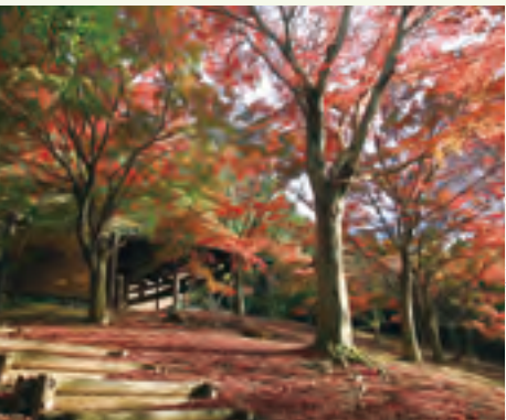
Autumn leaves in Chugendaira Ryokuchi Park