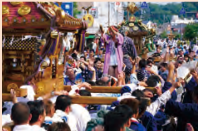
● Yorii Tamayodo Suitengu Festival

A festival in which dynamic and gorgeous mikoshi (a portable shrine) parade in the downtown area. While praying for a good harvest and good health, six male mikoshi from each district compete for bravery.