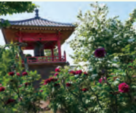
Japanese tree peony at Renkoji Temple