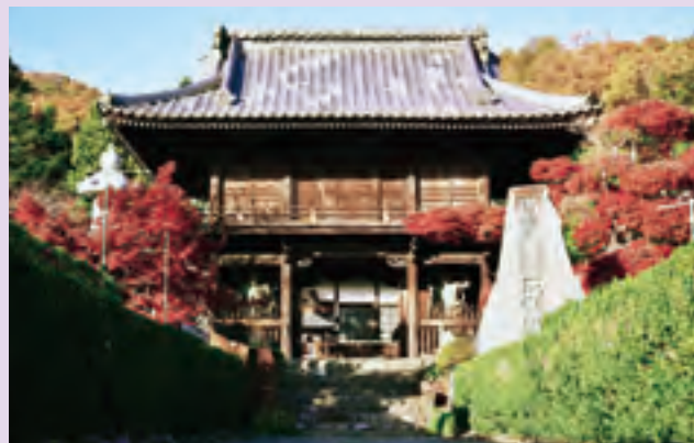
● Shoryuji Temple