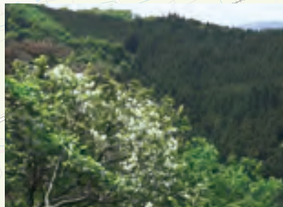
Goyotsutsuji (Rhododendron quinquefolium) It is the former site of a villa of Kabuki actor, the seventh Koshiro MATSUMOTO. In an area of more than 10,000 m2, you can enjoy flowers of Japanese dogtooth violet in spring, and autumn leaves in fall. Various trees and flowers grow naturally.