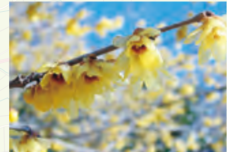
Winter sweet in Yamato no Sato