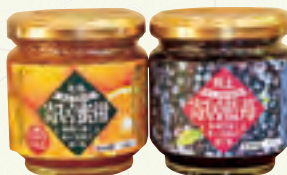
Mandarin orange/Blueberry jam

100% mandarin orange juice made from mandarin oranges produced in Yorii. Sold at Village Station Agurinkan.