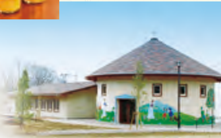
Village Station Agurinkan