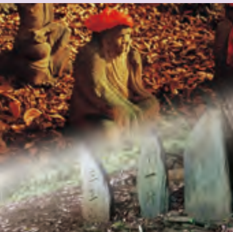
● Gohyaku Rakan (Five-hundred Rakan statues)

In Yorii, which flourished as a strategic point of transportation, there are many temples and shrines where you can feel the history. How about a leisurely tour of the temples and shrines?