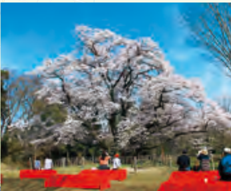
Edohiganzakura (Cerasus itosakura f. ascendens) in Hachigatajyo Park (known as Ujikunizakura)

The four seasons of "Yorii, the Town of Excellent Natural Water" start with winter sweet flowers, which bloom in Yamato no Sato. By and by, the town is painted in various colors throughout the year with Japanese apricot, Japanese dogtooth violet, cherry blossom, azalea, and autumn leaves.