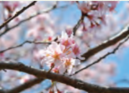
The town where you can enjoy cherry blossoms throughout the year Volunteers plant cherry blossom trees with a goal of growing 10,000 trees of 300 varieties of cherry blossoms. How about enjoying an encounter with blooming cherry blossoms every season?