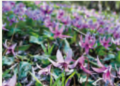
Flowers of Japanese dogtooth violet that herald the coming of spring